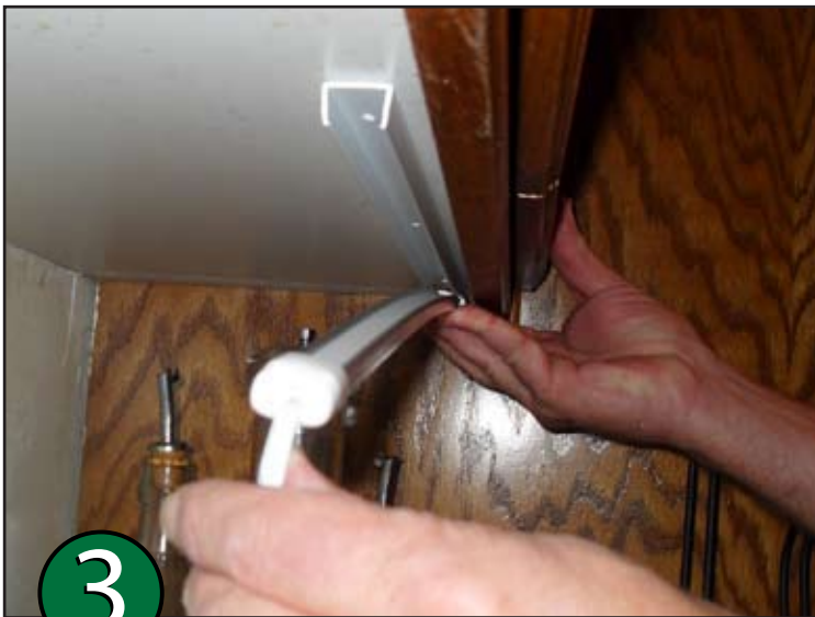
3 Remove LED lightcore from mounting bracket by pulling down on the left or right power connector.