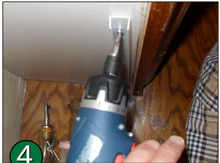
4 Install screws provided into LED mounting bracket using the holes provided.