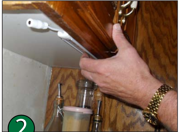
2 Locate fixture under the cabinet and apply the fixture firmly.