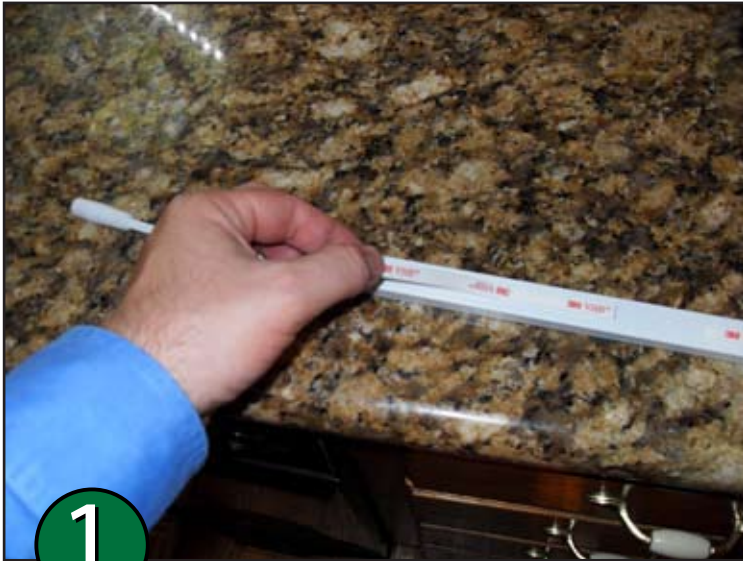
1 Remove backer from VHB tape on the back of the light fixture.