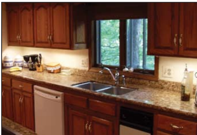
Picture shown using Warm White 3500K

Light-emitting Diodes (LEDs) are solid-state, semiconductor devices that convert electrical energy directly into visible light. Emeralight's LED modules are manufactured in Kansas City, Missouri!